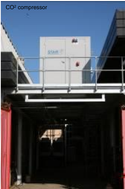
CO 2 compressor

A major insurer was planning a new datacentre to replace an existing 20-year old datacentre (constructed to approximately 400W/m 2 ). The new facility was expected to take 36-months to deliver. The 20-year old datacentre was expected to run out of UPS, generator and Cooling capacity before the datacentre became operational. A tactical upgrade to the 20-year old datacentre was required to extend its operational life until the new datacentre was available.